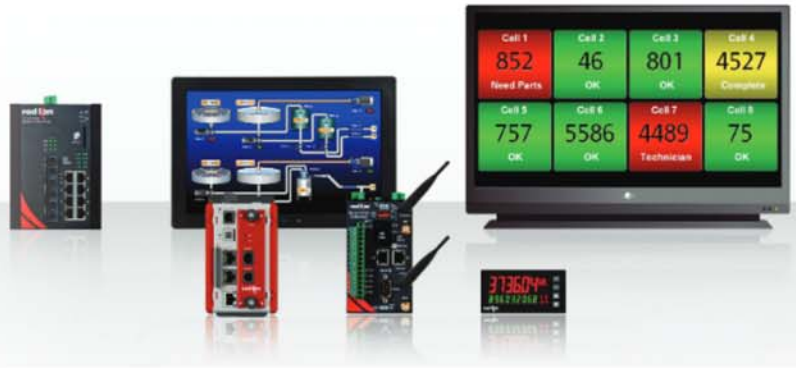
Products offered by Red Lion Controls